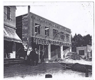
Above: The Liberty Block building under construction in 1915.

Olga married in 1916 and moved to Seattle. Sophia supported the rest of the family until 1918 when she succumbed to a nervous breakdown in the spring of 1918 and died sixteen months later. Olga took the younger children to live with her in Seattle.