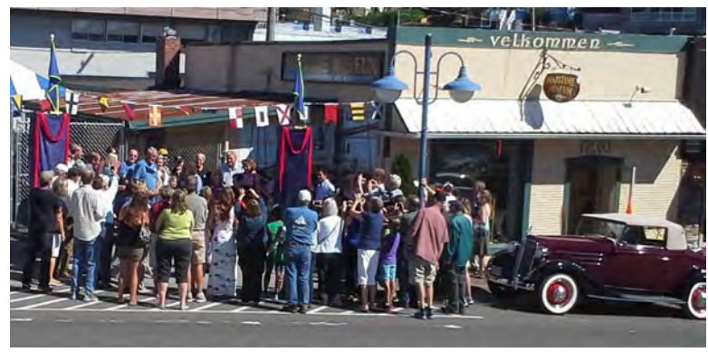
Grand opening of the Poulsbo Maritime Museum on Sept. 12

COME ONE...COME ALL! The summer was such a blur of hammering, painting, carpet laying, plumbing and display installation, that it's hard to know where to start with our quarterly report. Needless to say, those of us who spent 8 hours a day every day at the