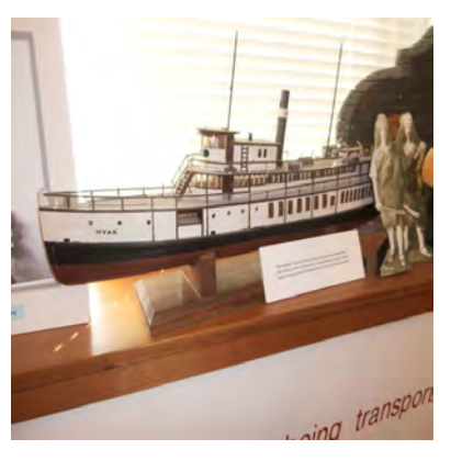
Model ships enhance the visual impact and interpret the meaning of museum exhibits.