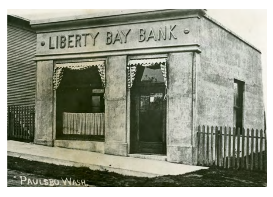
Our new museum began its service in 1910 as Liberty Bay Bank.

Maritime memorabilia is sought that has a connection to Poulsbo, Liberty Bay, and the general North Kitsap region. Items may be donated or loaned. Photos may be copied and returned to their owners.