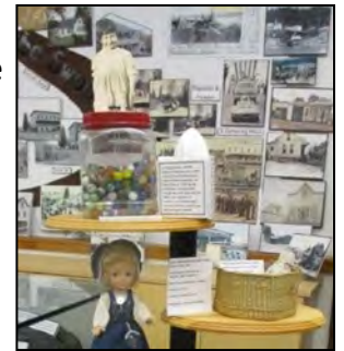
Stay and play a game of marbles at the Heritage Museum!

MARITIME MUSEUM: We installed new story panels on the wall of the boat yard. Our biggest new exhibit was the widely anticipated arrival of the replica HYAK Pilot house. The unit arrived from the Gig Harbor BoatShop in late April. Installation hit a few snags with integrating it into safe walkways and entrances for the general public. The crew from Gig Harbor is working on a solution to the problem, and our hope is to finally have the pilothouse open for the public and reconfigure the fence to enhance the view by spring.