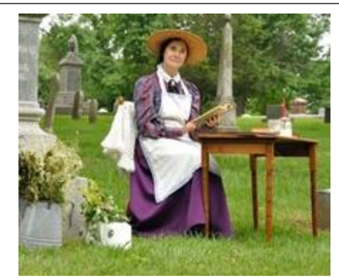
Left: First stop on othe 2023 tour. Right: This could be you!